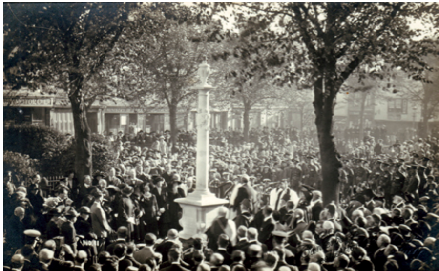
Original location of Royal East Kent Mounted Rifles Memorial near to St George's Gate